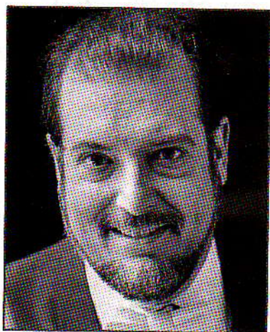
GARRICK OHLSSON piano

Since his triumph as winner of the 1970 Chopin International Piano Competition, pianist Garrick Ohlsson has established himself worldwide as a musician of magisterial interpretive and technical prowess. Although he has long been regarded as one of the world's leading exponents of the music of Frédéric Chopin, Mr. Ohlsson commands an enormous repertoire, which ranges over the entire piano literature. A student of the late Claudio Arrau, Mr. Ohlsson has come to be noted for his masterly performances of the works of Mozart, Beethoven and Schubert, as well as the Romantic repertoire. His concerto repertoire alone is unusually wide and eclectic—ranging from Haydn and Mozart to works of the 21st century—and to date he has at his command some 80 concertos.